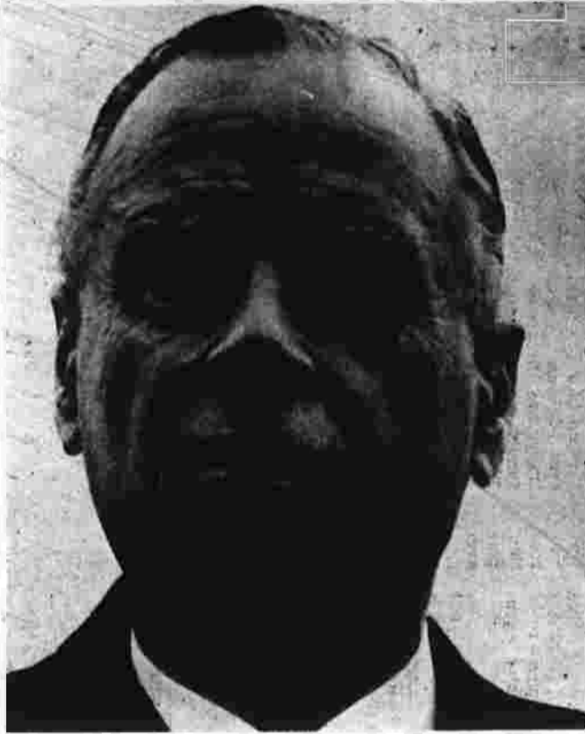
Marshall McLuhan in "This Is Marshall McLuhan: The Medium Is the Massage," Sunday, 3 p.m. on NBC.