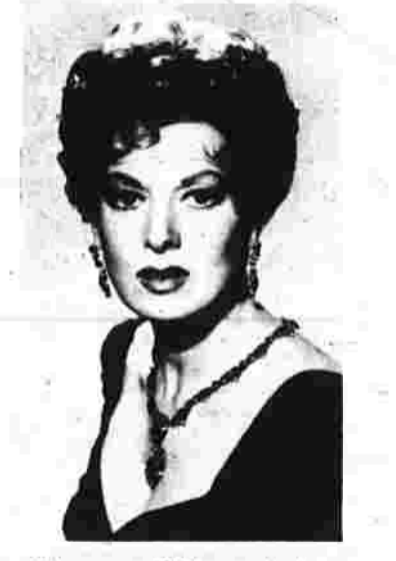
Maureen O'Hara stars with John Wayne in the movie "McClintock," Friday 9-11 p.m. on CBS.