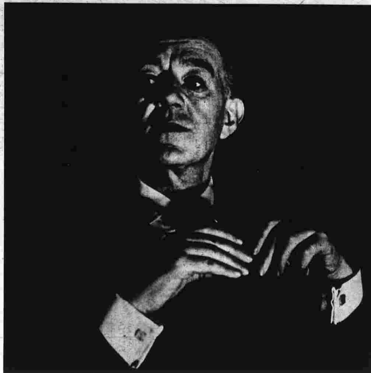
Sir Alec Guinness, one of several famous men of the theater in "The Actor" Friday 8:30 to 9:30 p.m.